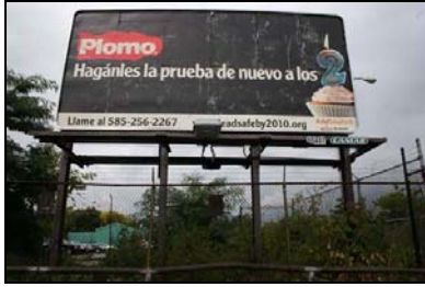
Test Again at Two billboard in Spanish on St. Paul Blvd.