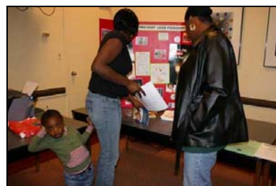
NLPPW Outreach at the University of Rochester’s Wilson Commons

The good news is that Governor Paterson’s office seems to have taken on this mission. Although he will face tremendous challenges regarding the state economy, Governor Paterson is nonetheless the only person positioned to address and remove the obstacles that have—since the 1990s—blocked progress in the struggle to establish true primary prevention programs in New York State. We hope that he will seize the opportunity to establish as an important part of his legacy that he was the one with the vision to take the bold steps needed, and finally eliminate lead poisoning for all children in New York.