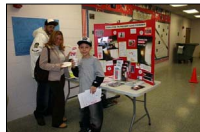
NLPPW Outreach, Hispanic Heritage Night at School No. 9, N. Clinton Ave.

Landlords and homeowners are encouraged to apply. Properties must be located in the city of Rochester and must have been built before 1978. Tenants and owner-occupants must meet income guidelines. Owner-occupants must have at least one child under age six.